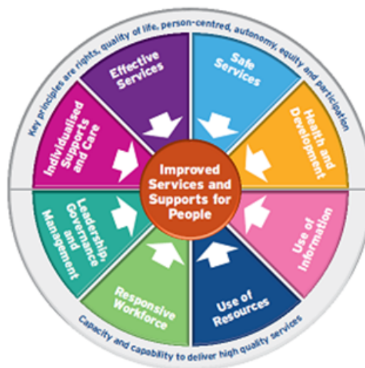
Figure 1: Themes in the National Standards